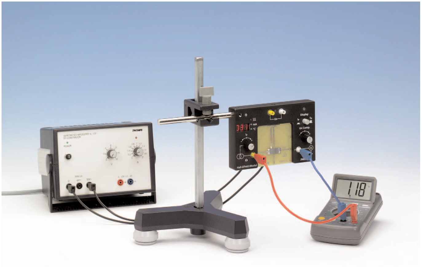
Fig.1: Experimental set-up for the determination of the band gap of germanium

The voltage across the sample is measured with a multimeter. Therefore, use the two lower sockets on the front-side of the module. The current and temperature can be easily read on the integrated display of the module. Be sure, that the display works in the temperature mode during the measurement. You can change the mode with the "Display"-knob. At the beginning, set the current to a value of 5 mA. The current remains nearly constant during the measurement, but the voltage changes according to a change in temperature. Set the display in the temperature mode, now. Start the measurement by activating the heating coil with the "on/off"-knob on the back-side of the module. Determine the change in voltage dependent on the change in temperature for a temperature range of room temperature to a maximum of 170°C. You will receive a typical curve as shown in Fig.2.