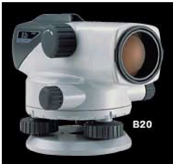
Figure 4 – Typical Surveying Level

Levels are field instruments that are used to project a level plane (a plane of constant elevation) in surveying (Figure 4). Levels are used to determine the difference in elevation (vertical distance) between two points on the surface of the Earth. Levels consist of a scope that magnifies the image of the target and a set of crosshairs that are used to determine the reading on the target. The target is either a graduated rod or ruler. Each level has a vial that is filled with fluid and a single bubble that is used to level the instrument and establish the level plane.