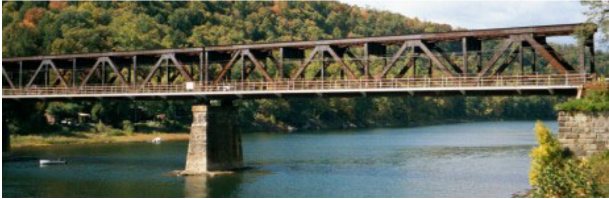
Figure 2 – Foxburg Bridge in Pennsylvania (Two Warren Trusses with Vertical Members)