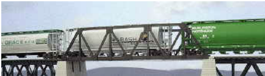
Figure 3 – Scale Model of a Warren Truss with Vertical Members

Strain (typically given the symbol \varepsilon ) is a measure of how much a material stretches when a force is applied to it. It is defined as the change in length of the material divided by the original length, \Delta L / L_o . For example, if a one-inch rubber band is stretched until it is two inches long, the strain in the rubber band is 1.0 = (2'' - 1'') / 1'' . Strain is a dimensionless measurement.